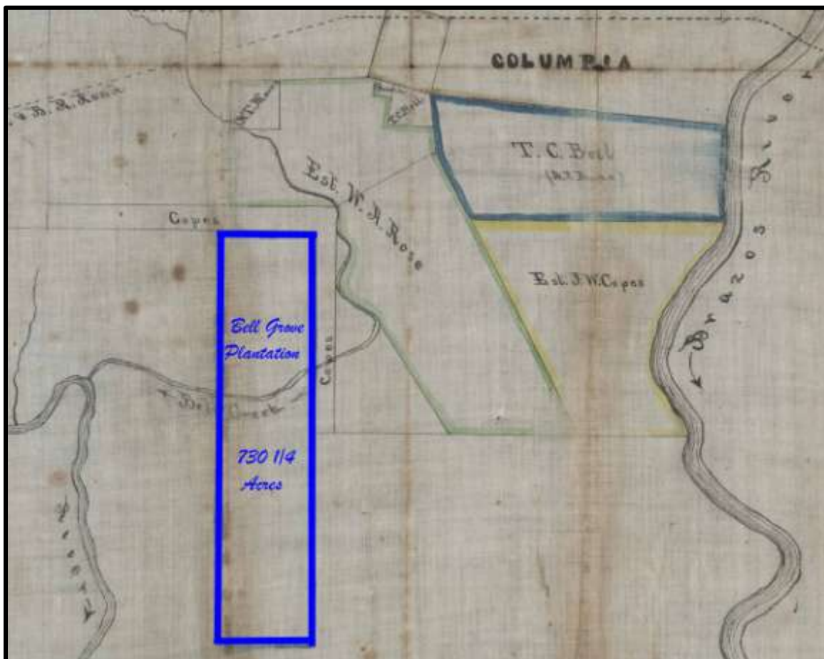
Map Courtesy of the Brazoria County Historical Museum 1983.010c.0005

Henson G. Westall built a cotton plantation using a small number of slaves. According to the 1850 Slave Census he owned 16 slaves.